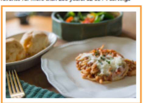
Vegetarian Baked Spaghetti

Hearty and filling, made from scratch, filled with shredded all-white meat chicken, and creamy stock gravy. A Moravian tradition and North Carolina favorite for more than 250 years. 32 oz / 4 servings