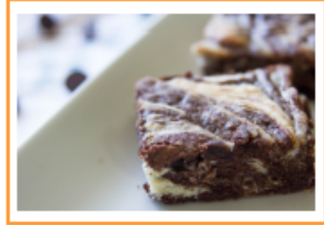
Cream Cheese Brownies

A classic and comforting casserole filled with ground beef, red sauce and spaghetti pasta. Topped with Mozzarella & Parmesan cheese and mixed herbs. 52 oz | 4 servings