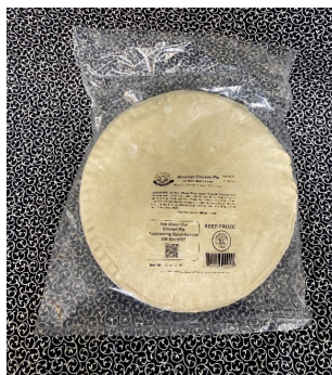
9" family size